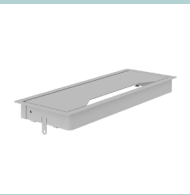
Metal grommet: 317x119 mm, H=27 mm