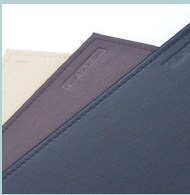
Leather table mats