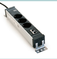
Power socket blocks